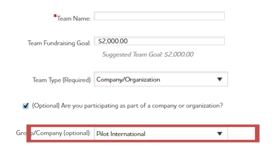
Start a Team

Select if you want to start a team, join a team or walk as an individual. If you've participated before, you can restart your team.